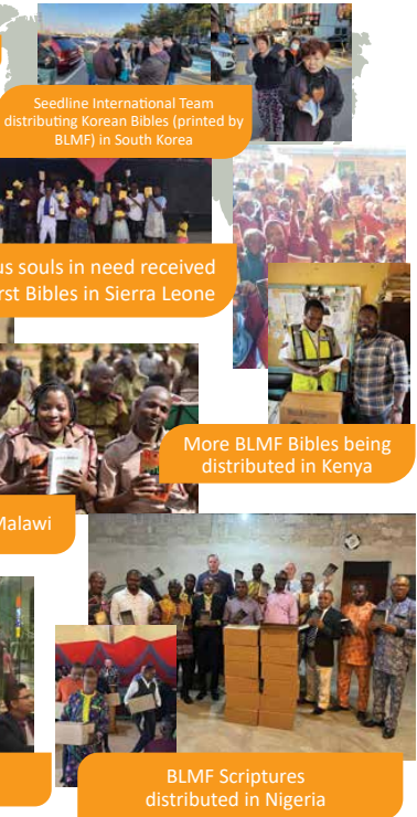
Seedline International Team distributing Korean Bibles (printed by BLMF) in South Korea